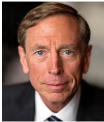
David Petraeus General, US Army (Ret.) & Former Director of the CIA