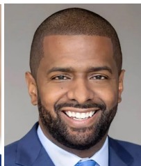
Bakari Sellers Former Member of the South Carolina House of Representatives, Bestselling Author & Political Analyst