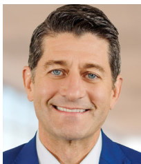
Paul Ryan Former Speaker of the U.S. House of Representatives 2015-2019