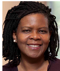
Annette Gordon-Reed American Historian & Pulitzer Prize-Winning Author