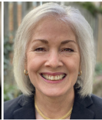
Marie Yovanovitch Former US Ambassador to Ukraine