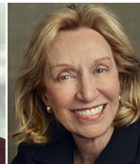
Doris Kearns Goodwin Presidential Historian & Pulitzer Prize-Winning Author