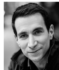
Andrew Ross Sorkin Bestselling Author, Co-Author of Squawk Box & Founder of DealBook