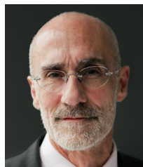
Arthur Brooks NYT #1 Bestselling Author, Harvard Professor & Renowned Social Scientist