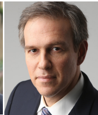
Moderated by Bret Stephens Pulitzer Prize Winner & Op-Ed Columnist for The New York Times