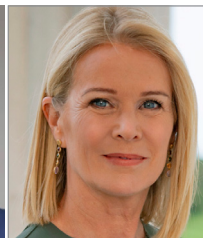
Moderated by Katy Kay U.S. Special Correspondent BBC Studios; Award-Winning Journalist & Bestselling Author