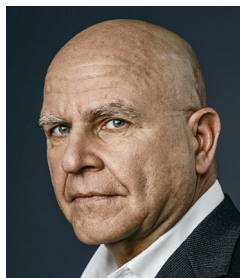
Lt. Gen. H.R. McMaster National Security Advisor, Lieutenant General, U.S. Army, Retired and Bestselling Author