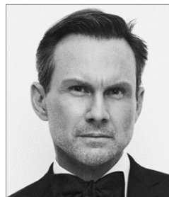
Christian Slater Award Winning Actor & Mental Health Advocate