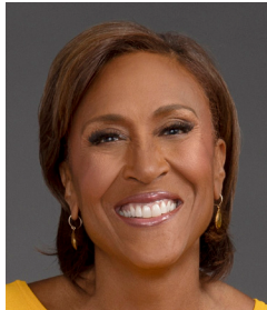
Robin Roberts Co-Anchor of ABC's 'Good Morning America', Best Selling Author & President, Rock'n Robin Productions