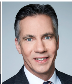
Moderated by Jim Sciutto CNN Anchor and Chief National Security Analyst