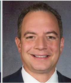
Reince Priebus White House Chief of Staff (2017) & Republican National Committee Chair (2011-2017)