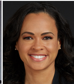
Moderated by Linsey Davis Host and Radio Correspondent, 'World News Tonight Sunday' and 'ABC News Live Prime'