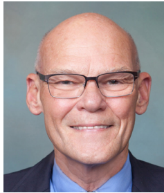
James Carville Political Icon