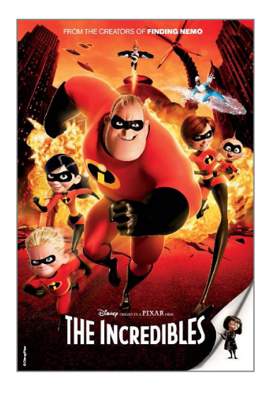
INCREDIBLES June 10

Gates open at 6:30 p.m. Movies start at 7:30 p.m.