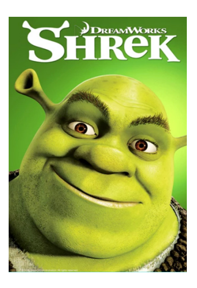
SHREK August 12

The Family Flick Night's season draws upwards of 2,000 guests.